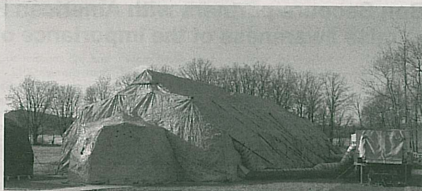
Shelters from DHS Systems of Orangeburg are being used to help keep participants and volunteers warm this weekend at the Knickerbocker Ice Festival at Rockland Lake. The shelters are used by the U.S. military around the world.