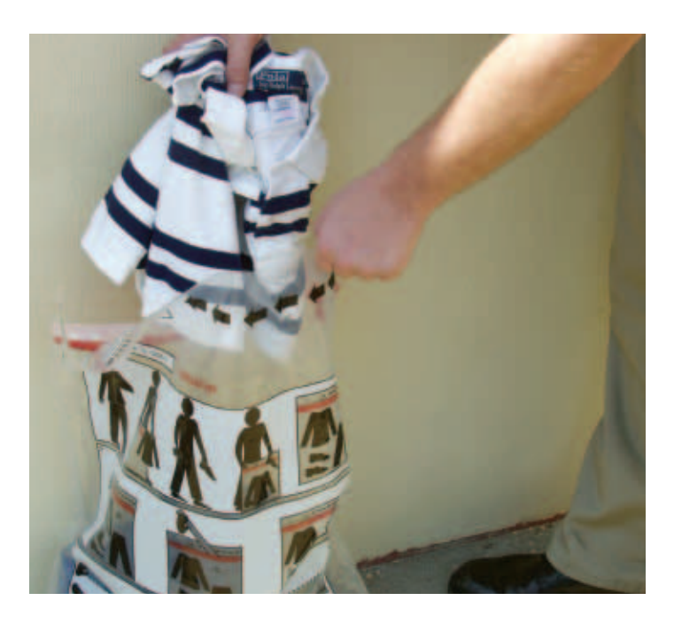
Large SECUR-ID Decon Property Bag – Series 2 RDPW0200

The Large SECUR-ID Decon Property Bag is a disposable, tamperevident bag designed to safely and securely store the outer garments, shoes and personal possessions of a possibly contaminated patient for easy tracking during the decontamination process. The patient simply removes his/her garments and personal items, places them inside the bag, seals the bag, removes the tear-off strip and slips it over their wrist as their "property receipt." Large SECUR-ID Decon Property Bag are available in packs of 50.