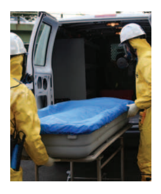
Remains Tray Cover

The limited-use Reeves Remains Tray Cover fits snugly on the Reeves Mortuary Decon Remains Tray. The cover is constructed of a dark blue, 6 oz. lightweight vinyl that is water-resistant, mildew-resistant and anti-fungal. Remains can be placed on the Reeves Remains Transfer Sheet and placed into the Tray for decontamination. The tight-fitting Remains Tray Cover is then placed over the Tray to conceal its contents.