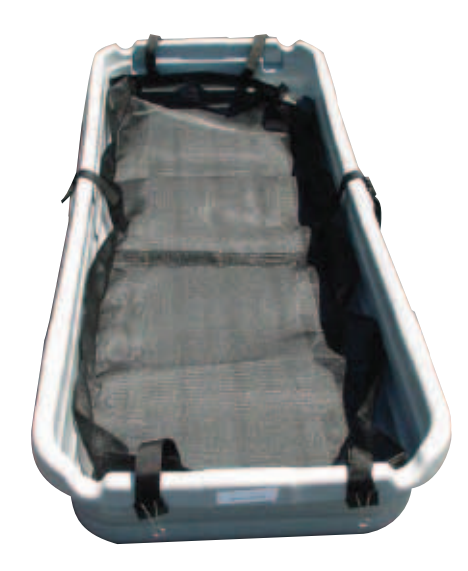
Remains Transfer Sheet RSS0015

Options: Remains Tray Cover; Remains Transfer Sheet, Ball Valve and Discharge Hose