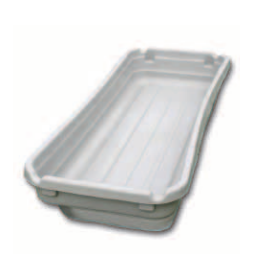
Mortuary Remains Tray with Drain RDA0047

The Reeves Mortuary Decon Remains Tray is made of a decontaminable High Density Polyethylene (HDPE). The tray has four (4) notches – two (2) at each end – that allow a mesh pole litter with remains placed on top to sit securely over the tray, ensuring that "dirty" runoff is properly contained during the mortuary decontamination process. Each tray includes a 3/4" threaded male drain port with cap. An optional ball valve and discharge hose set-up allows the tray to be drained without fear of contamination leakage.